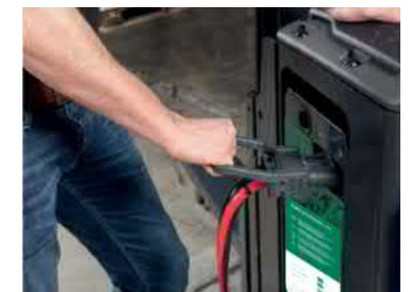
Figure 2: On either of the tray sides