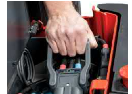
Figure 1: On battery top